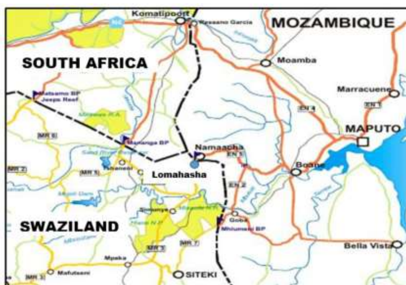
Fig 1: Project Location

Lomahasha is a rural town located in Eswatini and Namaacha is a densely populated city located in Mozambique.