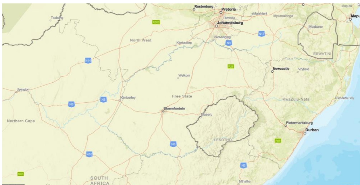
Figure 2: Locality Map: Free State Province, South Africa