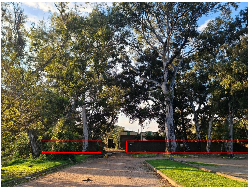
Figure 7: Concrete fence for demolition highlighted.