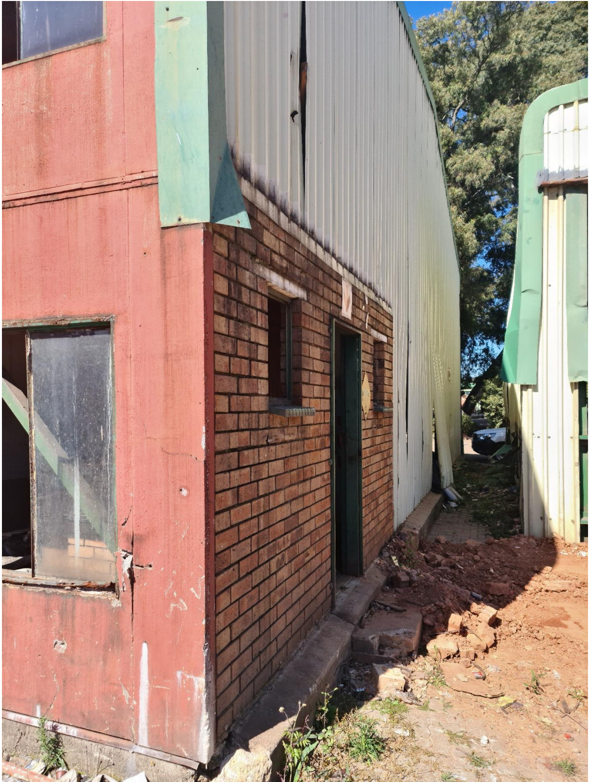
Figure 9: The western corner of the building showing some of the face brick wall that needs to be demolished. The red concrete wall also needs to be demolished.