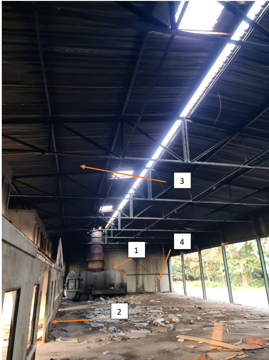
Figure 2: Inside main building. Incinerator hearth (1) to be removed and disposed of (the chimney extends upwards directly from it). Internal walls to and platform to be removed (2). Roof sheeting to be removed (3). Egoli gas connection to be undisturbed (4).