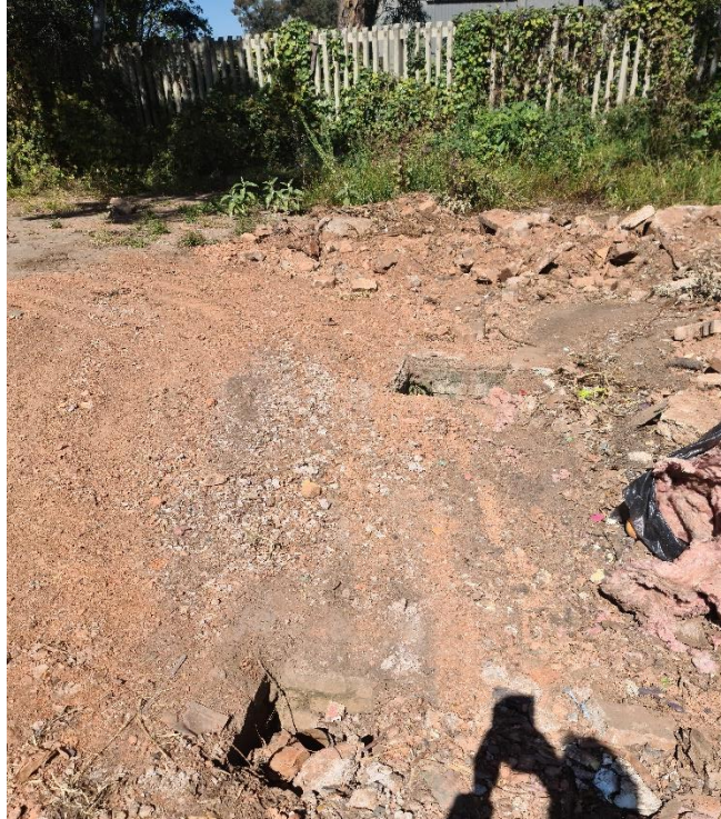
Figure 6: Location of the underground diesel tanks that need to be excavated and removed. Brick paving should be retained on site for later reuse and earth filled back into the hole