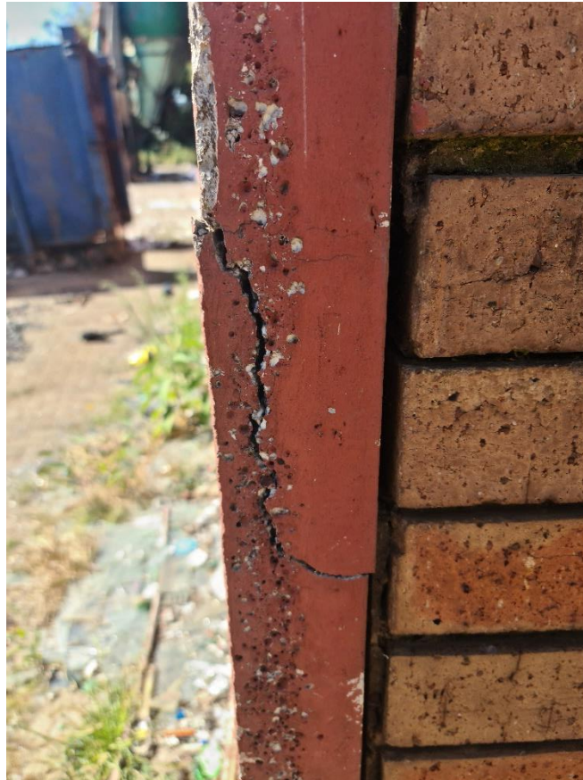
Figure 4: Side view of cast concrete north wall that is to be demolished. Face brick section should also be demolished.