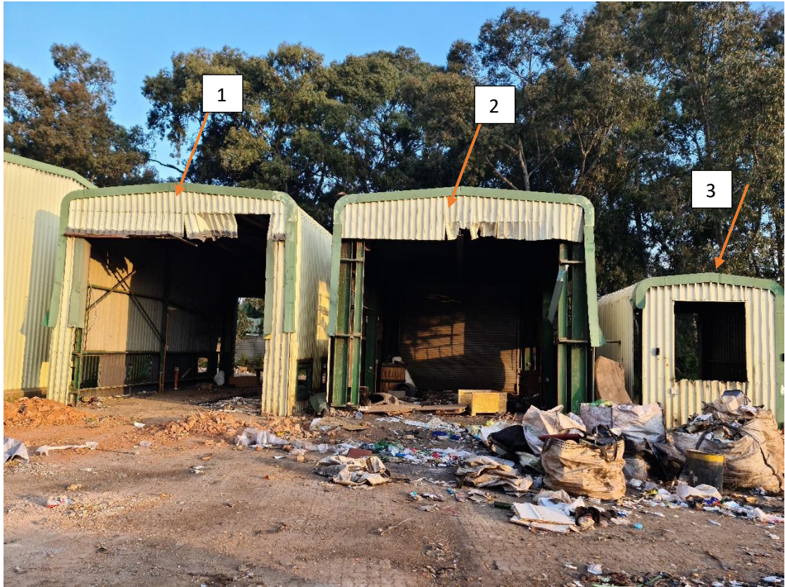
Figure 3: (1) and (2) are the two identical sheds that need to be stripped of roof sheeting. (2) the roller shutter door needs to be removed also. (3) a small shed that needs to be demolished.