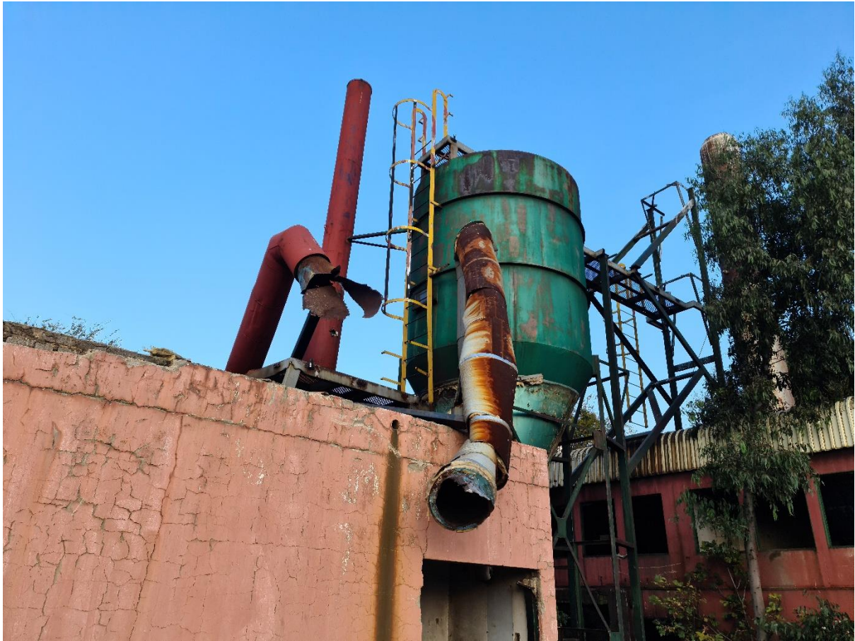
Figure 10: Another view of the chimney and steel flue gas treatment structure and vessels that needs to be removed. The loose standing pink coloured brick building needs to remain in tact.