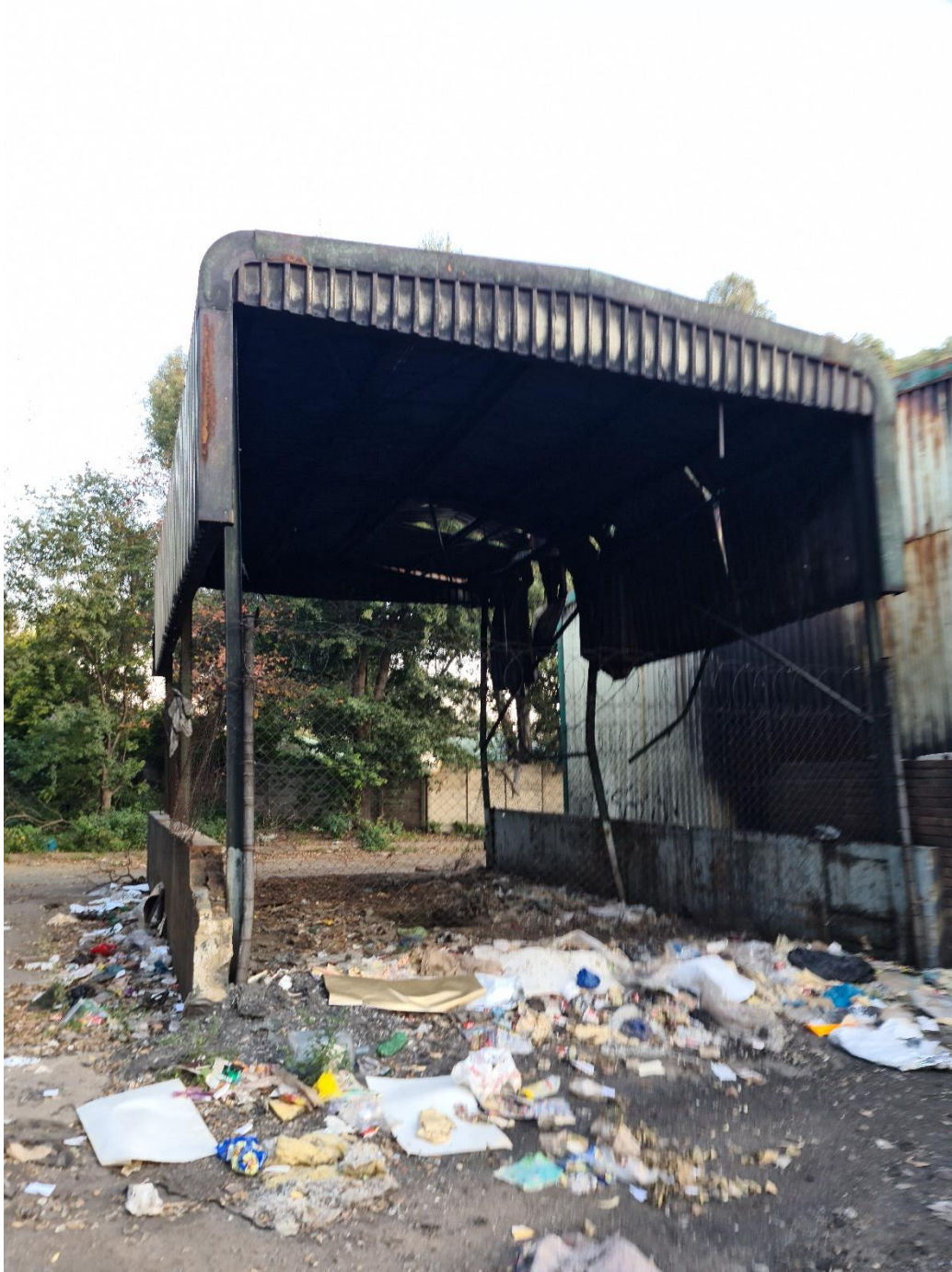
Figure 8: Old washbay with side walls that needs to be demolished completely.