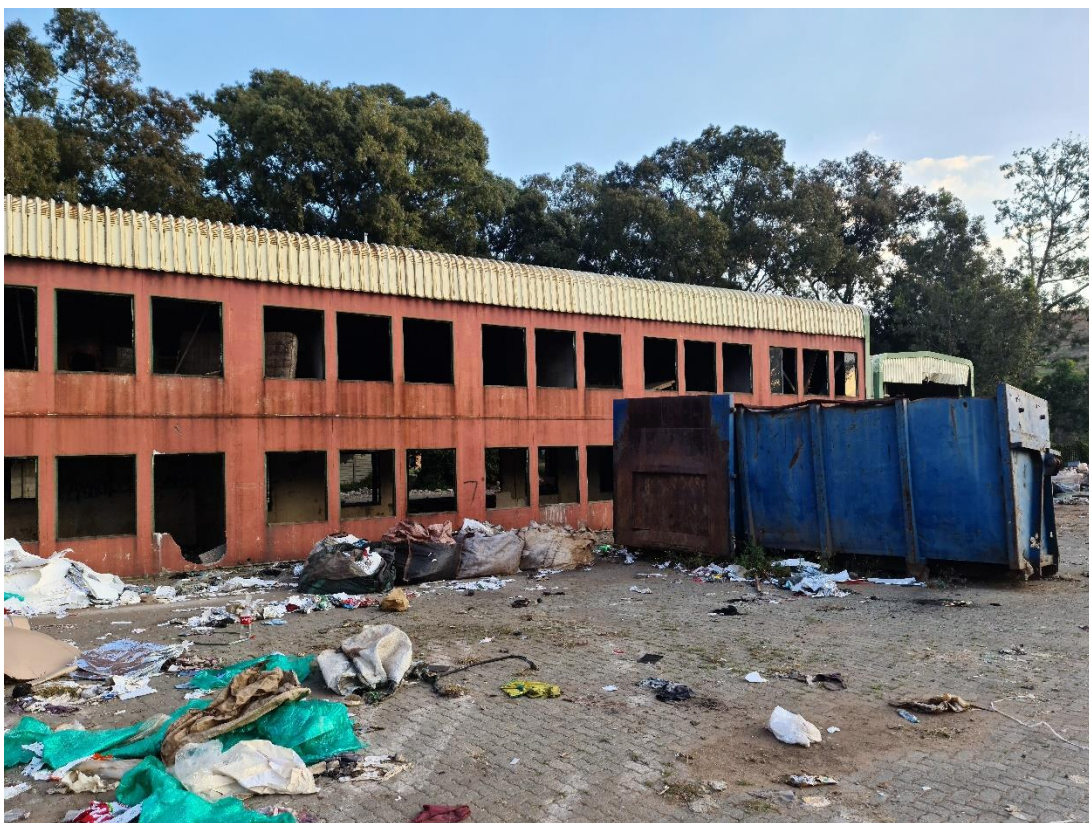
Figure 5: The red wall with the multiple window frames needs to be demolished.