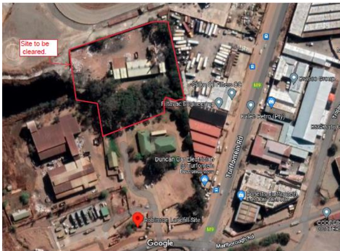
Figure 1 & 2: Robinson Deep Landfill, Johannesburg, Locality Map Site Coordinates: - 26°13'47.84"S; 28° 2'31.80"E