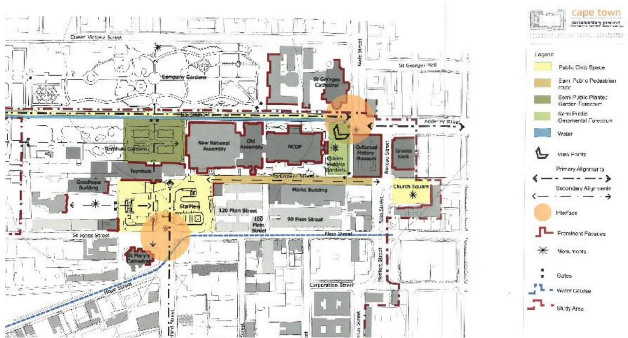
Locality plan : Parliament Precinct – Indication of the prominent facades