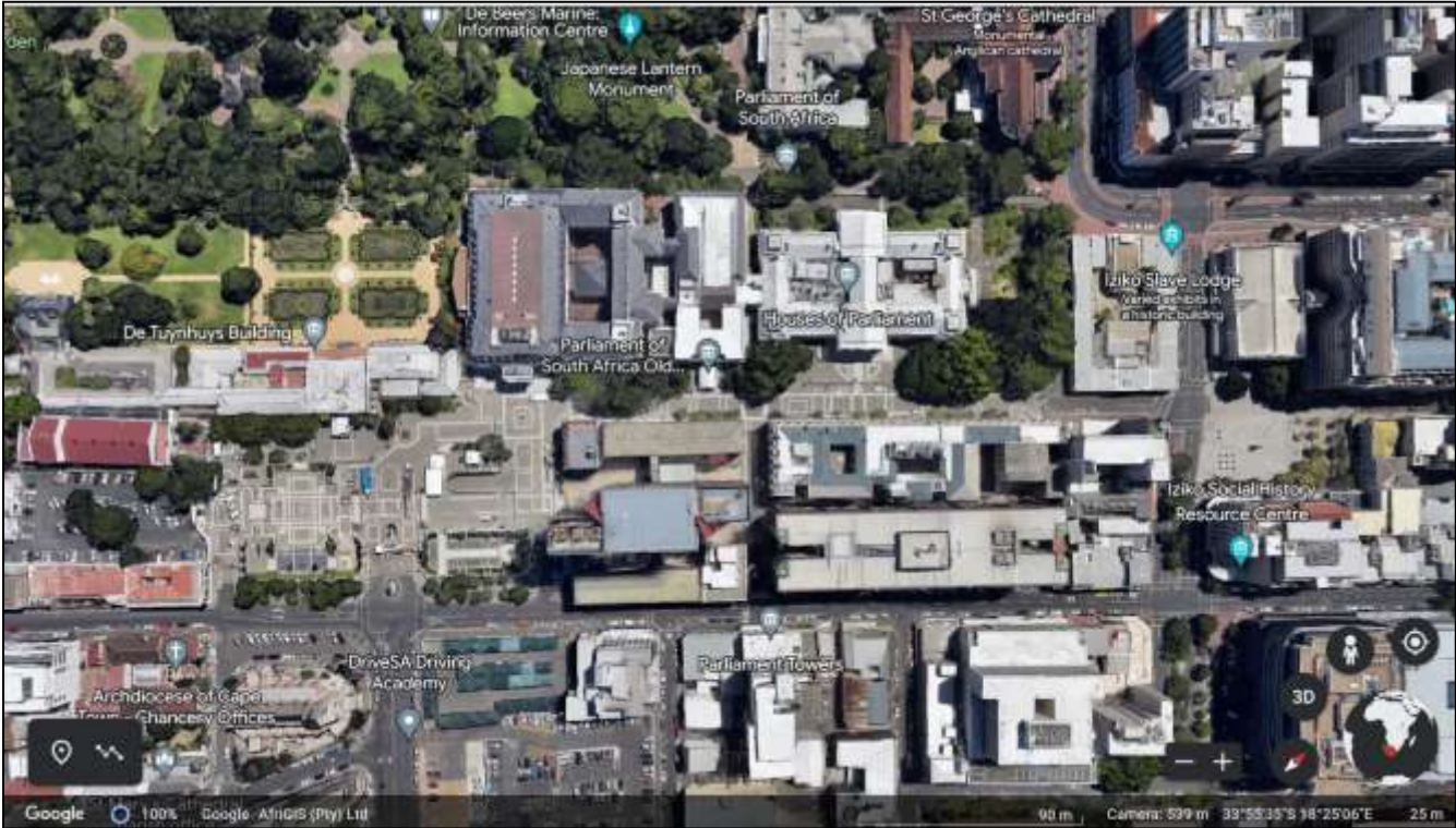
Figure 3: Street view of the Parliament Precinct