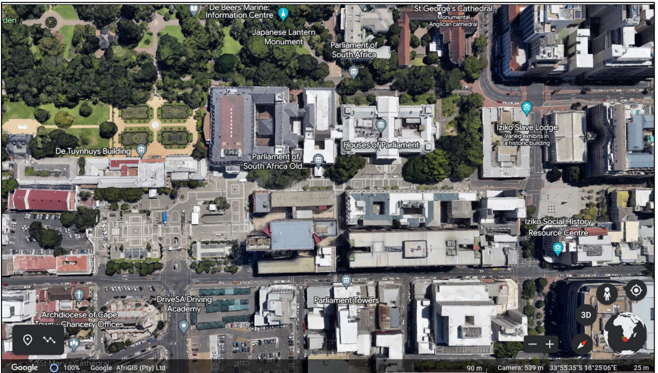
Figure 3: Street view of the Parliament Precinct