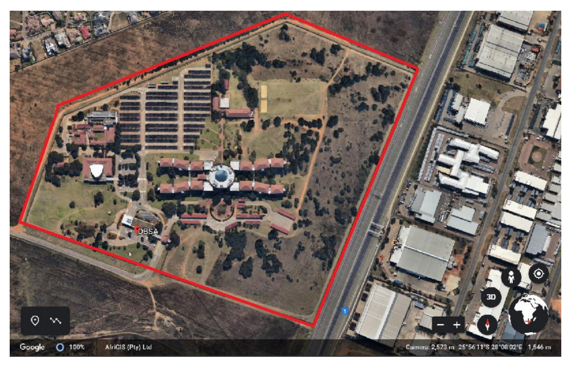
Figure 1: DBSA Midrand Campus

The total area of the DBSA campus occupied by the buildings is 29 600 m<sup>2</sup>. This is shown in Figure 1 below. The campus has ample land space for future developments, however there may be portions of land that may have environmental sensitivities. DBSA is currently undertaking an environment assessment.